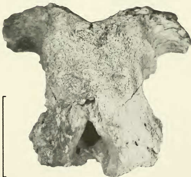
Fig. 5. Caudal surface, PM 526. Line represents 10 cm.